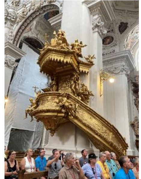
An elaborate gold leafed pulpit raised above the pews for acoustical effect, accessible by a winding staircase.

One thing to note about the physicality of what I call this flying golden pulpit: most of the people attending this cathedral in earlier centuries would have been illiterate. Therefore, visuals were important in conveying not only biblical stories and stories of saints and heroes of early Christendom, but visual impacts also had to convey ecclesiastical power and authority as divinely conferred on the Catholic (meaning universal) Church. For example, on the inside of the umbrella-like structure over the priest's head, there is a depiction of a dove, wings spread against the sun's rays which represents the Holy Spirit, an aspect of the Trinitarian Godhead believed to be the divine breath of inspiration.